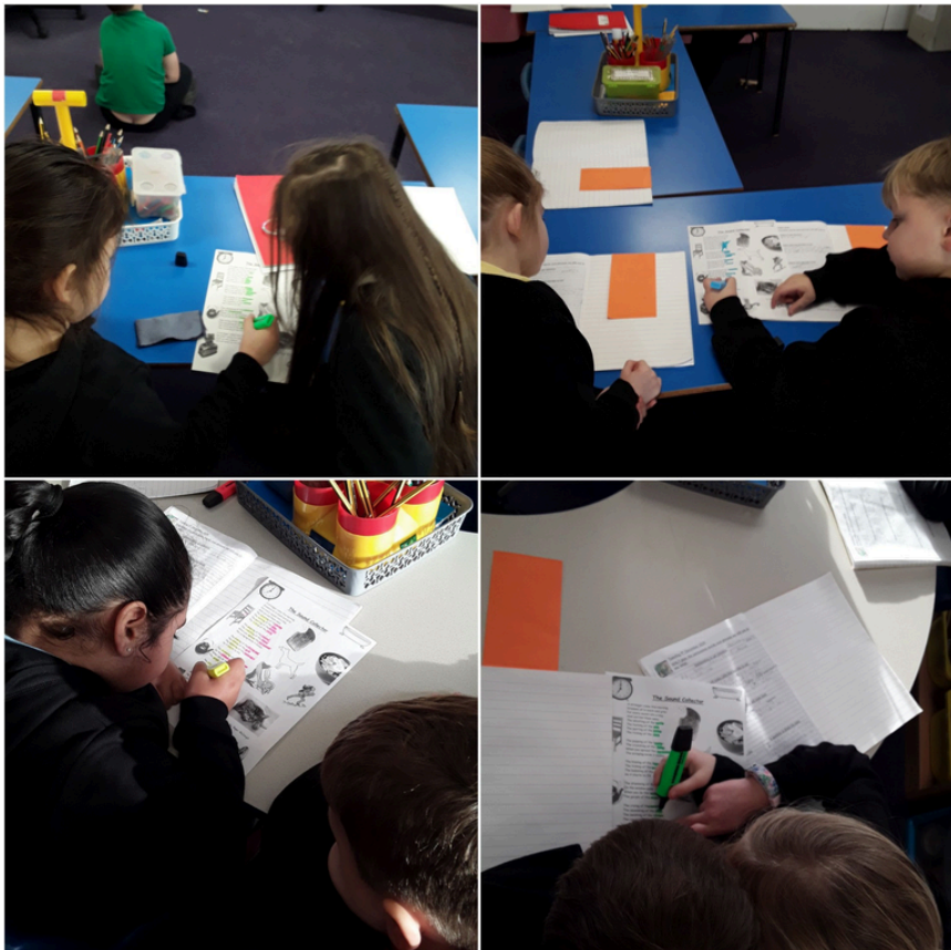
Our Year 2 children have been looking at the structure and patterns in the poem 'The Sound Collector'.