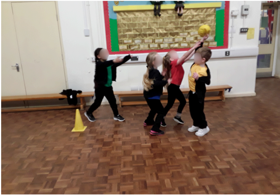
Our Year 1 children have been practising how to attack and defend in PE this week.